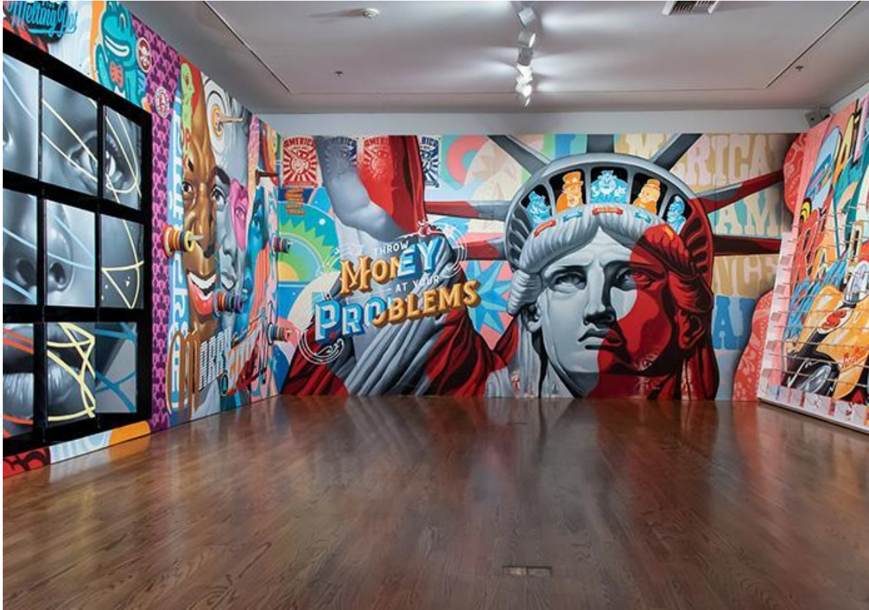
Tristan Eaton, "Unfair Fun Fair," 2021, installation of interactive murals

A room size installation, "The Unfair Fun Fair" (2021), also called "American Dream," features 88 feet of interactive murals, beginning with the words, "Play or Get Played," and "The rules are made to be broken." Embedded within these murals are several old-fashioned looking carnival style games that viewers can play, while exploring the social inequities in our culture. Games include "Throw Money at Your Problems," "911 Roulette" (in which the player never wins), "Stir the Melting Pot," "Your Future is a Puzzle" and "Marry a Citizen," featuring a succession of people of different races.