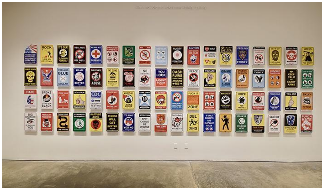
TrustoCorp, "Guerrilla street art collective signs," 2008-13